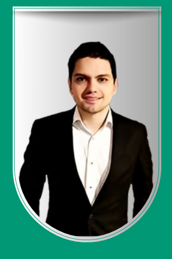
Director of Communications