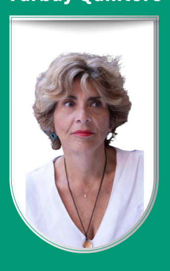
Director of External Affairs