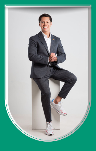
Director of Afro and Indigenous Affairs